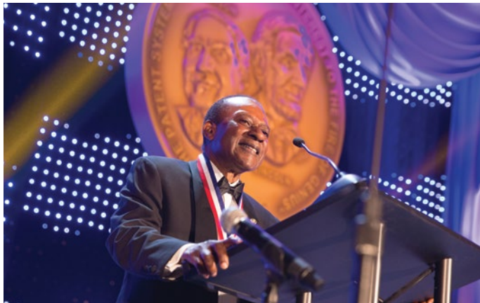
Victor Lawrence, Inventor of Signal Processing in Telecommunications, at the 2016 National Inventors Hall of Fame Induction Ceremony